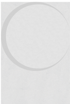
EC 0.1 Partial Ice