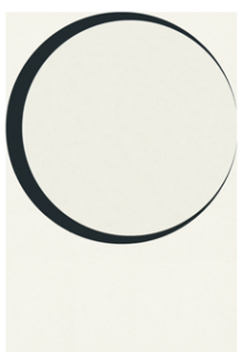
EC 0.1 Annular White