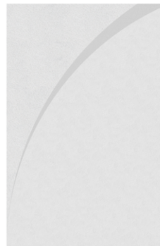
EC 0.3 Partial Ice