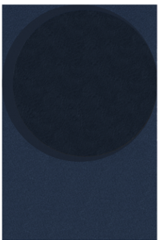
EC 0.1 Total Blue