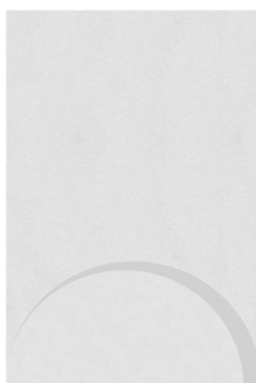
EC 0.2 Partial Ice