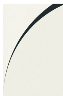
EC 0.3 Annular White